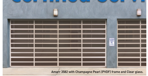
Amarr 3582 with Champagne Pearl (PVDF) frame and Clear glass.

Amarr 3582 Aluminum MultiView doors make a unique design statement with the widest single piece of glass that specifications, safety, and reliability standards allow. Constructed of 2" thick extruded aluminum rails and stiles, these doors are built to last. The ClearView Aluminum Strut System provides strength and durability without restricting the viewing area. With a wide selection of glass, acrylic and polycarbonate glazing options, in more than two dozen paint and anodize finishes, the Amarr 3582 is a distinctive choice for any building where style and functionality are important.